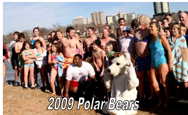
2009 Polar Bears