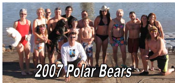
2007 Polar Bears