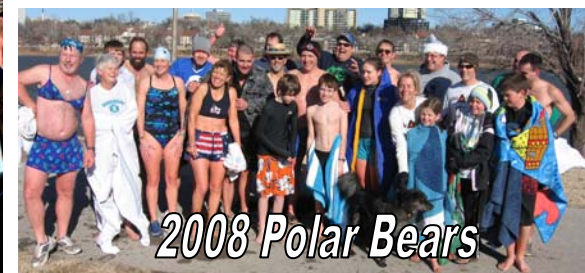
2008 Polar Bears